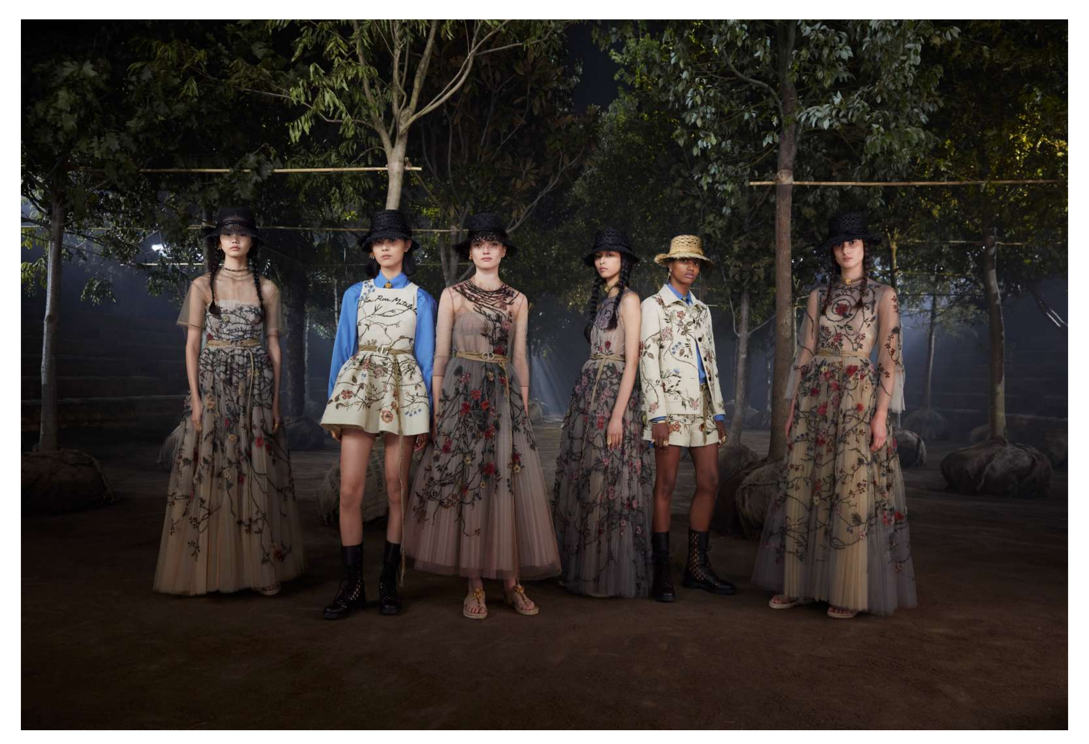
FIND THE 8 DIFFERENCES THAT SLIPPED INTO THESE IMAGES