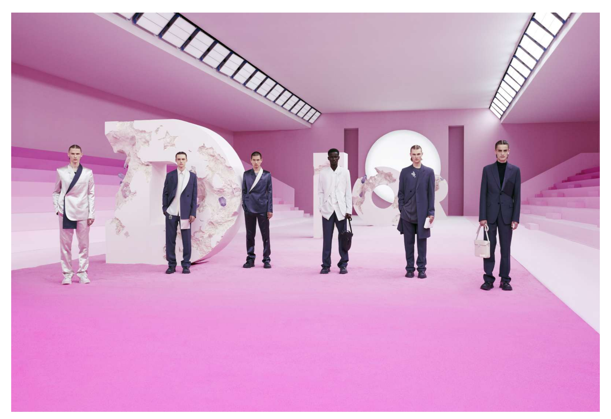
FIND THE 8 DIFFERENCES THAT SLIPPED INTO THESE IMAGES