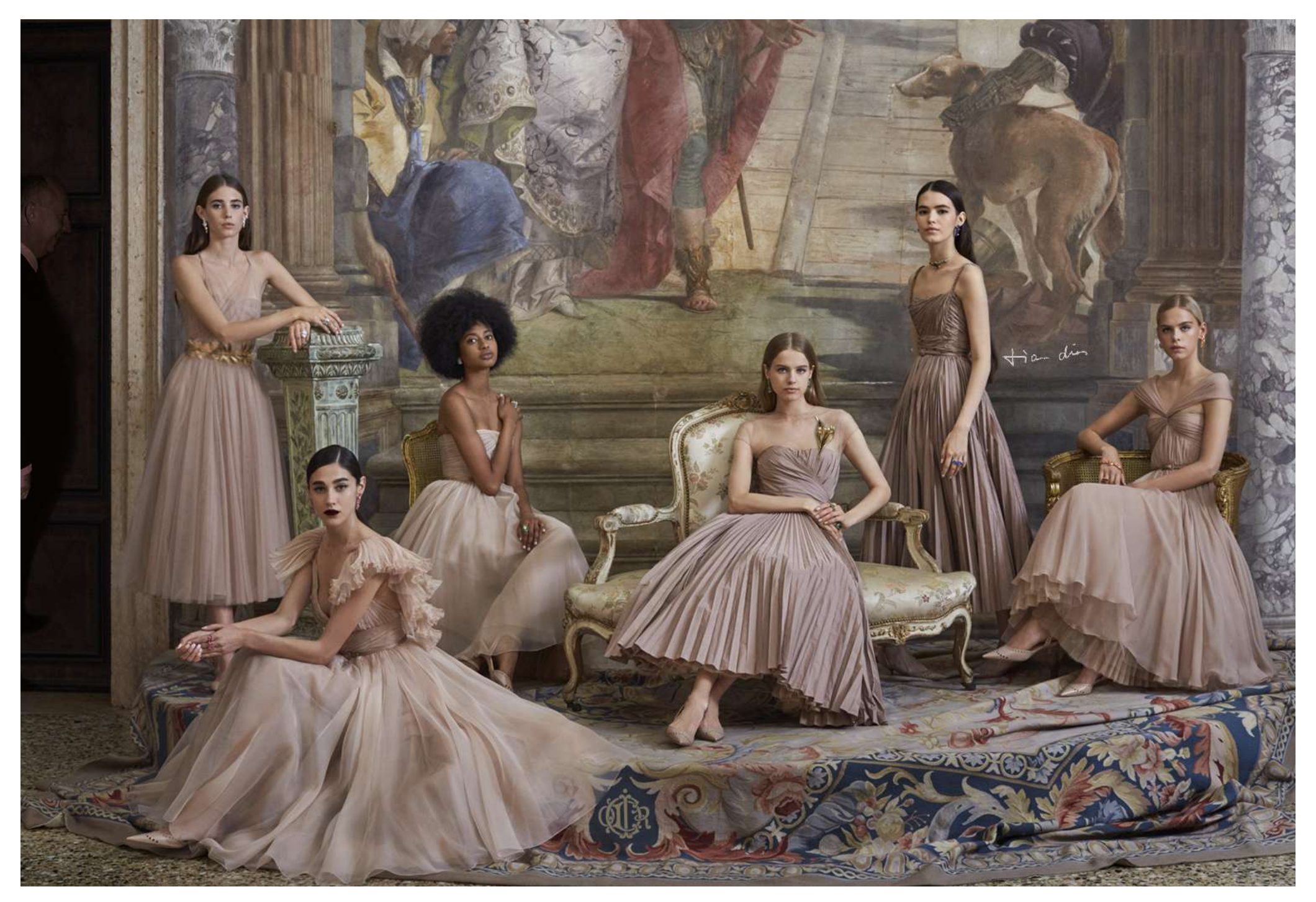
FIND THE 8 DIFFERENCES THAT SLIPPED INTO THESE IMAGES